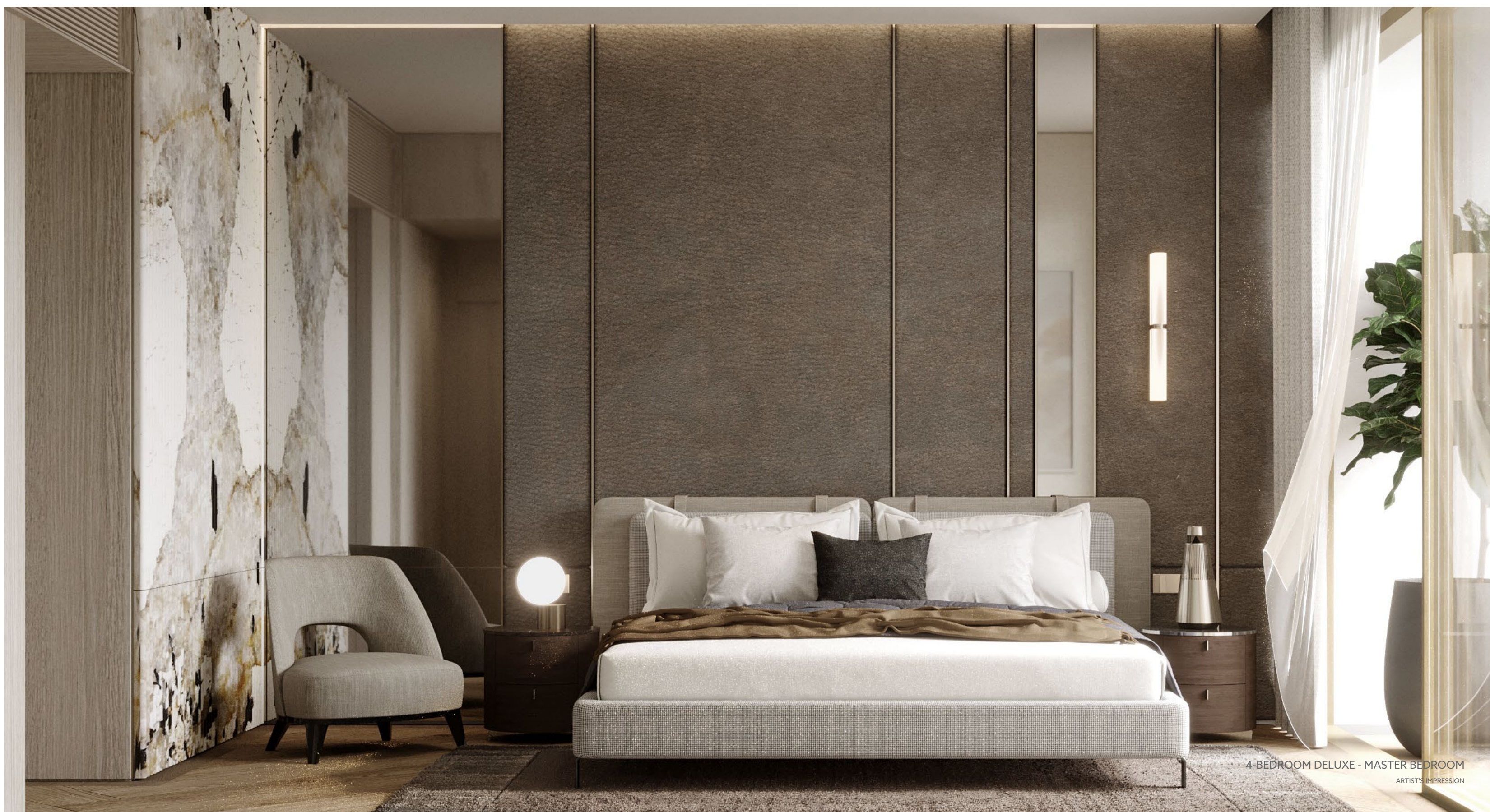
4-BEDROOM DELUXE - MASTER BEDROOM ARTIST'S IMPRESSION

Each bedroom is spacious enough to fit a king-sized bed and comes with an ensuite bathroom for exclusive privacy. Not forgetting its own view of the world outside.