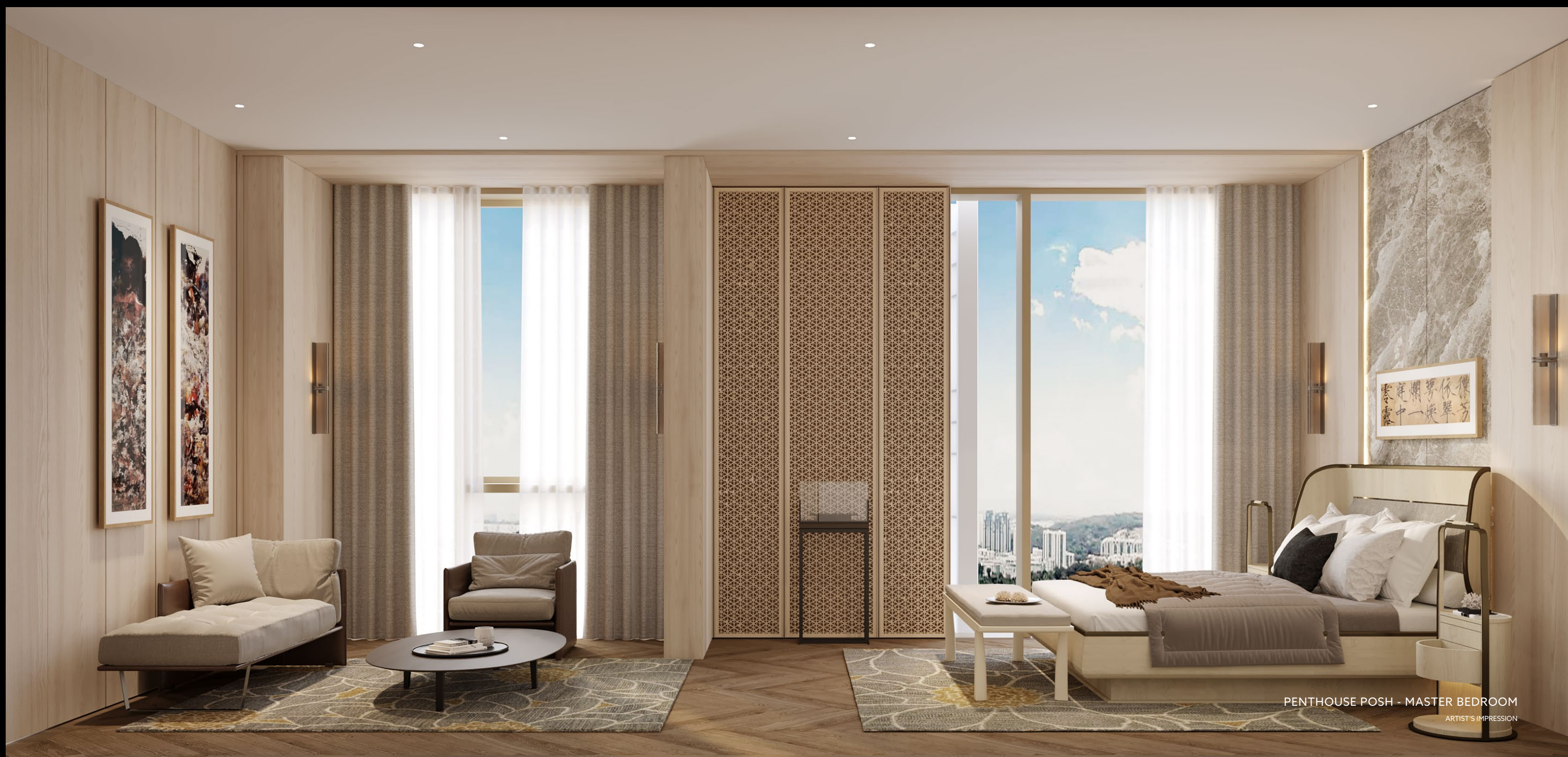
PENTHOUSE POSH - MASTER BEDROOM ARTIST'S IMPRESSION