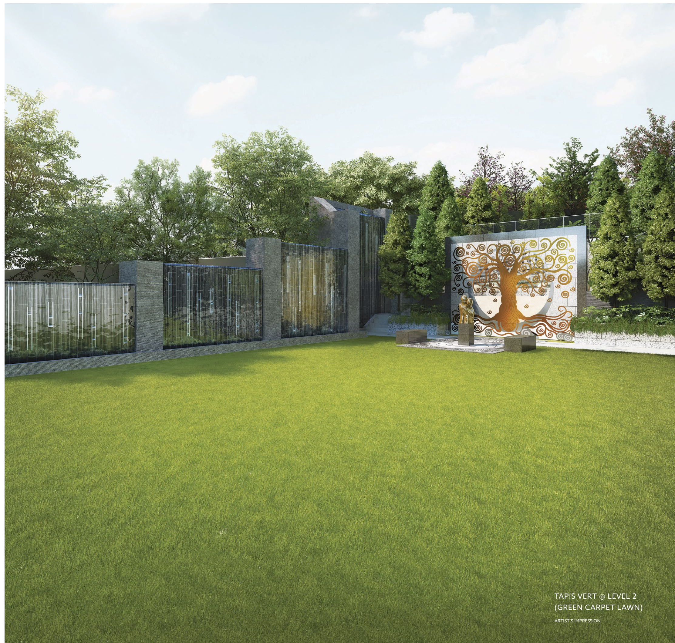
TAPIS VERT @ LEVEL 2 (GREEN CARPET LAWN) ARTIST'S IMPRESSION

Celebrate the luxury and joy of outdoor living at home.