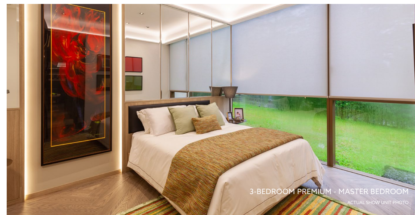
3-BEDROOM PREMIUM - MASTER BEDROOM ACTUAL SHOW UNIT PHOTO

The Premium home is designed with considered proportions and functional layouts, ensuring that a warm, welcoming interior ambience awaits you, all the time.