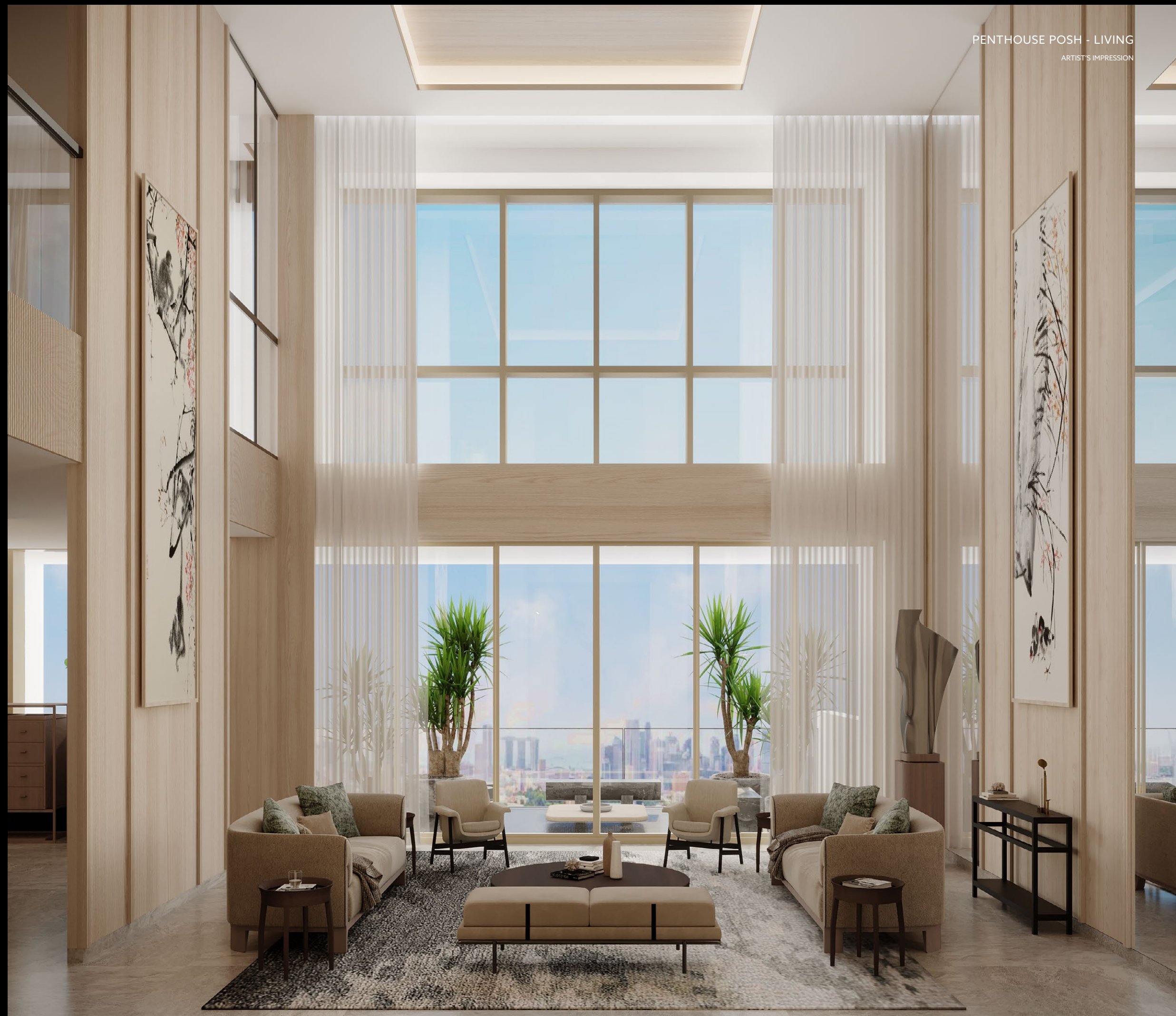
PENTHOUSE POSH - LIVING ARTIST'S IMPRESSION

Both come with six lavishly appointed bedrooms, giving abundant space and opportunities for your family to grow.