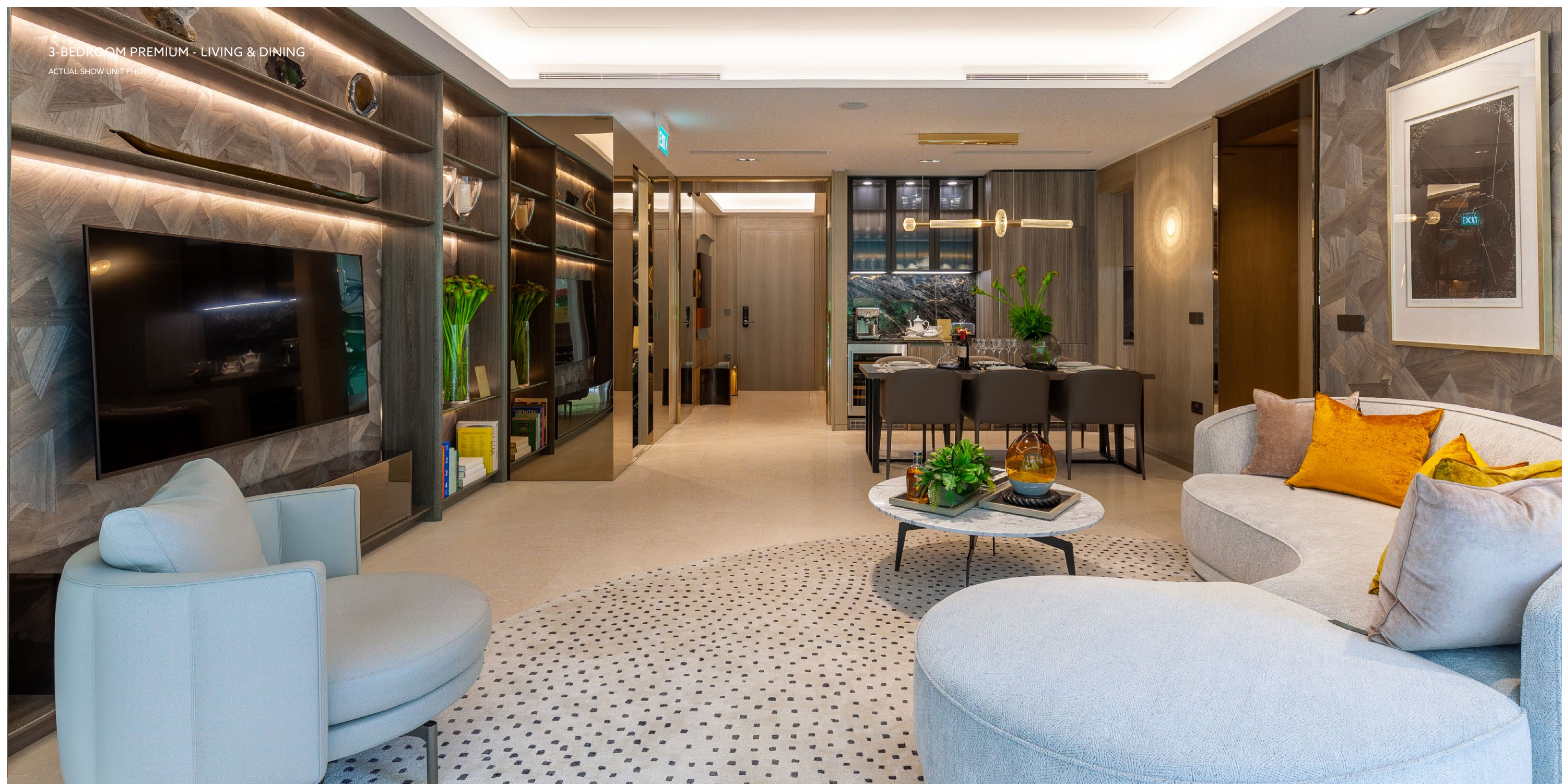
3-BEDROOM PREMIUM - LIVING & DINING ACTUAL SHOW UNIT PHOTO