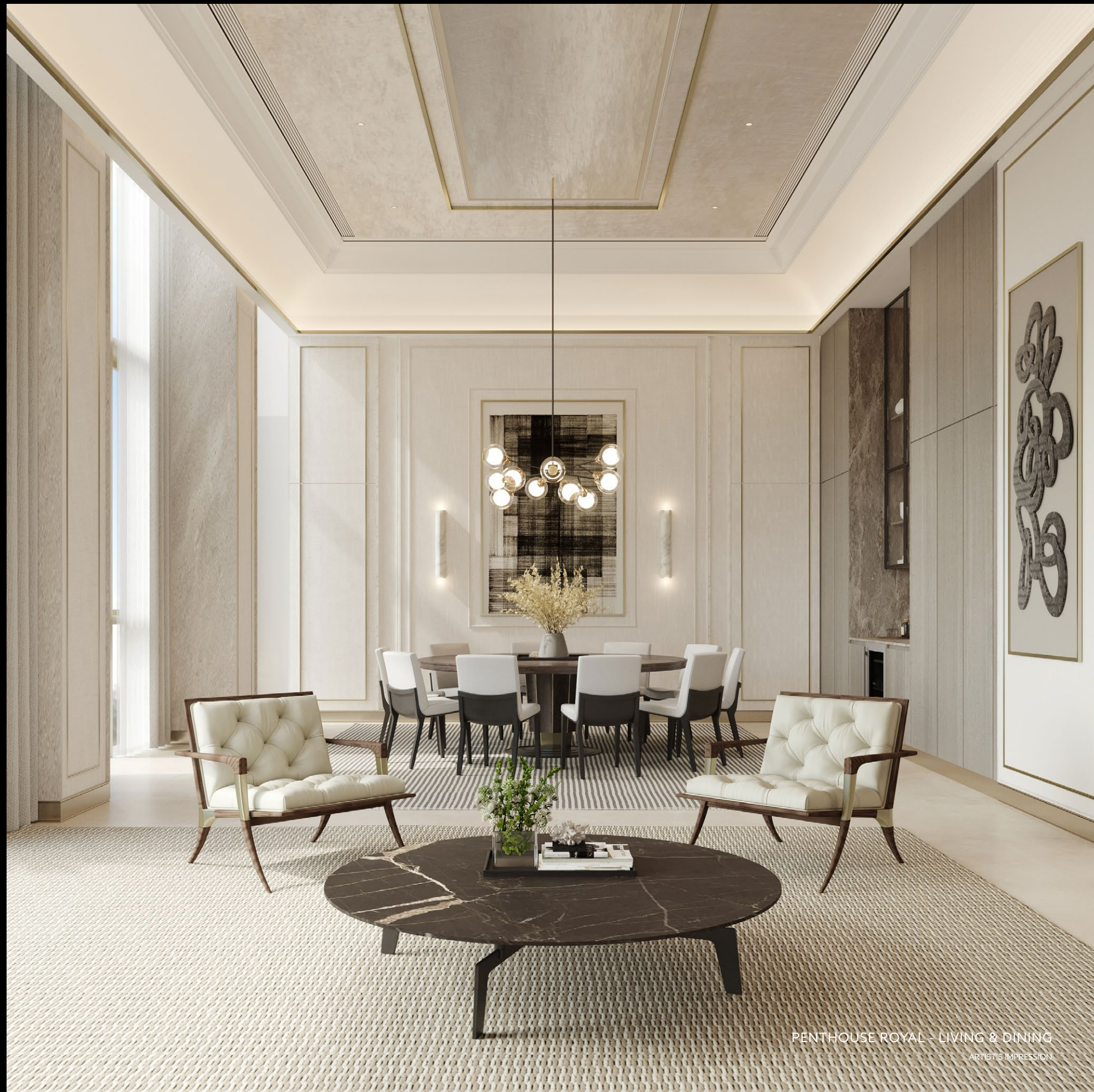
PENTHOUSE ROYAL - LIVING & DINING ARTIST'S IMPRESSION